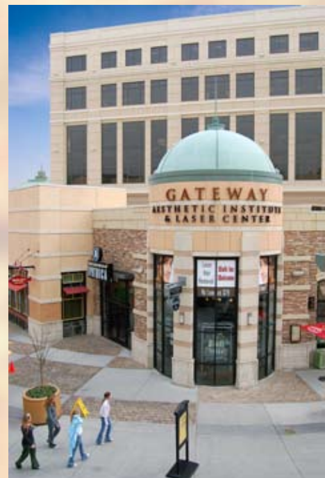
The Gateway entrance to our office building