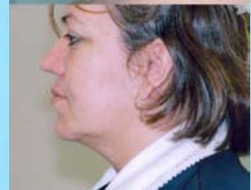
LipoDissolve Treatment on Neck