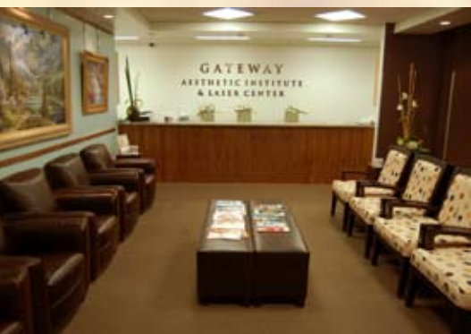
Our upstairs waiting room