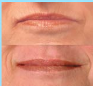
Filler for Smoker Lines on Upper Lip