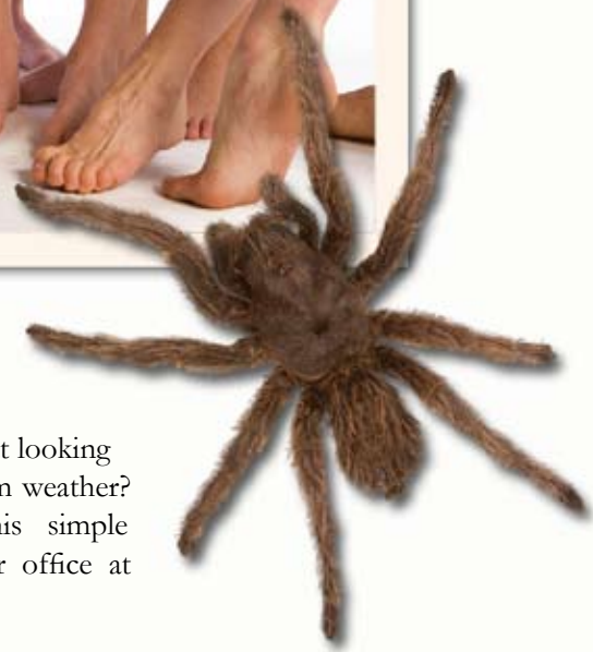
Before & After Vein Treatment at the Gateway Aesthetic Institute

Are you ready for great looking legs, just in time for warm weather? Get the details on this simple procedure by calling our office at 801-595-1600. ©