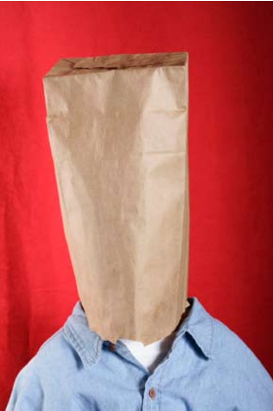
We offer better options at the Gateway Aesthetic Institute

If you were a teenager who struggled with acne or if you have a teenager who struggles with acne, you know how embarrassing and frustrating the condition can be. Luckily, there are many options available today to treat those unforgiving pimples.